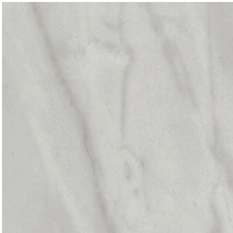
60 x 60 cm (24 x 24) VN.AR.GRY.2424.HN